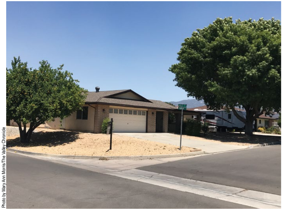
Home values in Hemet and San Jacinto both continue to rise steadily.